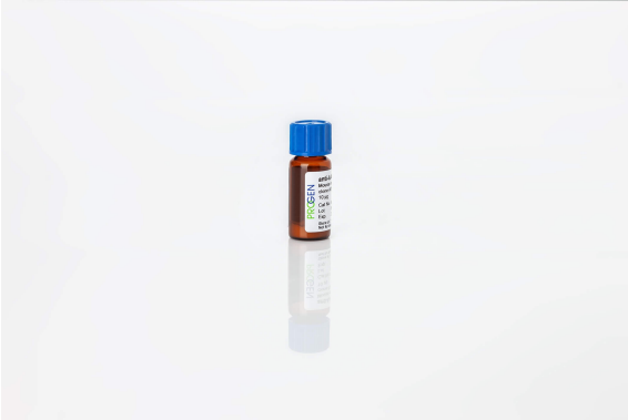
anti-M13/fd/F1 Filamentous Phages mouse monoclonal, B62-FE2, Biotin Conjugate

Phage ELISA with B62-FE2 as capture antibody (Cat. No. 61097) and B62-FE2, Biotin conjugate (Cat. No. 61597) as detection antibody (1:5000 (0.02 µg/ml) and 1:1000 (0.01 µg/ml)).