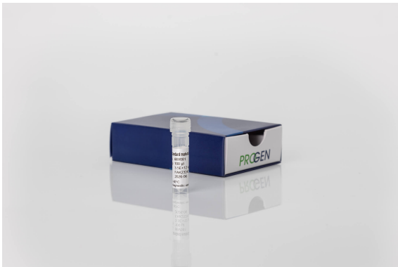
AAV6 standard material (eGFP)