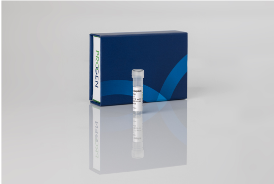
AAV9 empty capsids