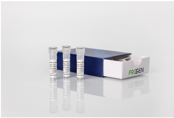
AAV8 VP1, recombinant protein