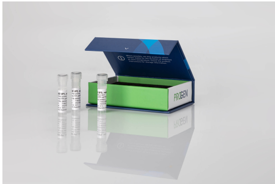
AAV8 VP3, recombinant protein

Western blot analysis of recombinant AAV8 VP3 (Cat. No. 640841) with B1 antibody (Cat. No. 690058) and ECL detection. Western blot analysis was performed on different amounts of recombinant AAV-VP3 ranging from 7 ng to 34 ng. The PVDF membrane was blocked with 5% milk in PBST for 1 h at RT. The primary antibody anti-AAV VP1/VP2/VP3, B1 (Cat. No. 690058) was diluted in blocking buffer (antibody concentration 500 ng/ml) and incubated for 1 h at RT. The secondary antibody anti-mouse IgG HRP was also diluted in blocking buffer (antibody concentration 200 ng/ml) and incubated for 1 h at RT. The bands were visualized by chemiluminescent detection using Pierce ECL Western Blotting Substrate.