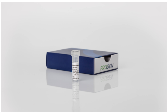
AAV8 standard material (eGFP)

SDS PAGE with AAV8 eGFP-filled capsids. The AAV8 VP1, VP2 and VP3 proteins were separated on a 10% SDS PAGE and visualized by Pierce Silver stain kit. Only VP1, VP2 and VP3 proteins in the correct stoichiometry of 1:1:10 are detectable indicating a purity of the AAV preparation of >95%.