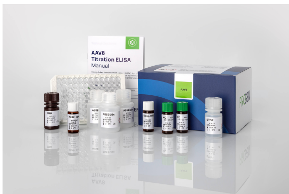
AAV8 Titration ELISA