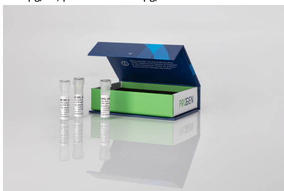
AAV2 VP3, recombinant protein

Pipetting scheme for western blot analysis using a mix of the AAV2 capsid proteins (Cat. No. 640823, 640824, 640825). To create a VP mixture with the molar ratio 1:1:10 (VP1:VP2:VP3), please pre-dilute VP1 and VP2 1:10 to yield a final concentration of 10 µg/ml (green table). Pipette the pre-diluted VP1 and VP2 proteins and mix them with the undiluted VP3 protein in your sample buffer and water (blue table). The example with 2x and 3x sample buffer and the required volumes are indicated in the pipetting scheme. Thus, in one lane, 10 µl of the VP mix can be loaded onto the SDS PAGE and analyzed by Western blot using the B1 antibody (Cat. No. 690058, Cat. No. 61058-488, Cat. No. 61058-647). Undiluted = 100 µg/ml, pre-diluted = 10 µg/ml