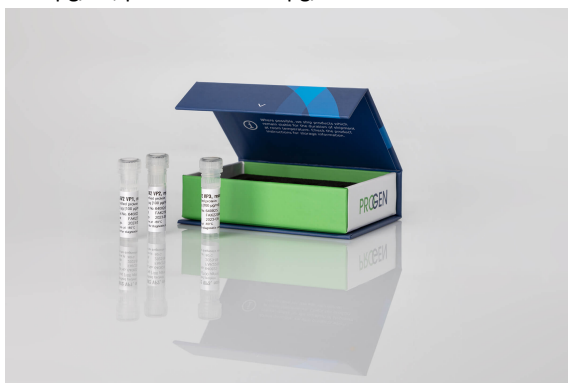
AAV2 VP3, recombinant protein

Pipetting scheme for western blot analysis using a mix of the AAV2 capsid proteins (Cat. No. 640823, 640824, 640825). To create a VP mixture with the molar ratio 1:1:10 (VP1:VP2:VP3), please pre-dilute VP1 and VP2 1:10 to yield a final concentration of 10 µg/ml (green table). Pipette the pre-diluted VP1 and VP2 proteins and mix them with the undiluted VP3 protein in your sample buffer and water (blue table). The example with 2x and 3x sample buffer and the required volumes are indicated in the pipetting scheme. Thus, in one lane, 10 µl of the VP mix can be loaded onto the SDS PAGE and analyzed by Western blot using the B1 antibody (Cat. No. 690058, Cat. No. 61058-488, Cat. No. 61058-647). Undiluted = 100 µg/ml, pre-diluted = 10 µg/ml